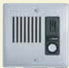
IE-JA Door station