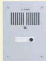
IE-FY Door station