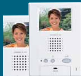
Color monitor handsfree station with optional handset