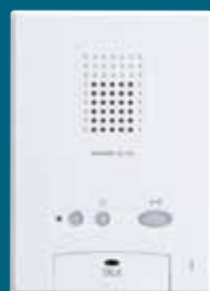
Audio handsfree station