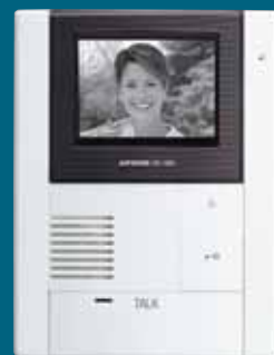
B&W monitor handsfree station